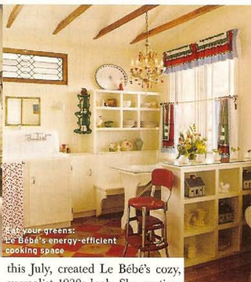
Eat your greens: Le Bébé's energy-efficient cooking space