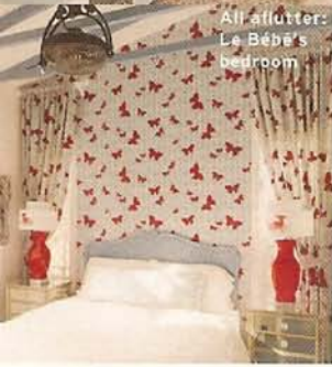
All alliter: Le Bébé's bedroom

We laud large hotel chains' recent greenlining attempts (go Fairmont, with your smart composting and water conservation), but for a truly tiny (and pretty) footprint, we love the Venice Beach Eco-Cottages. The three former crack houses turned solar-powered retreats represent the three r's at their best. Each one-bedroom cottage (Papa Hemingway, Aunt