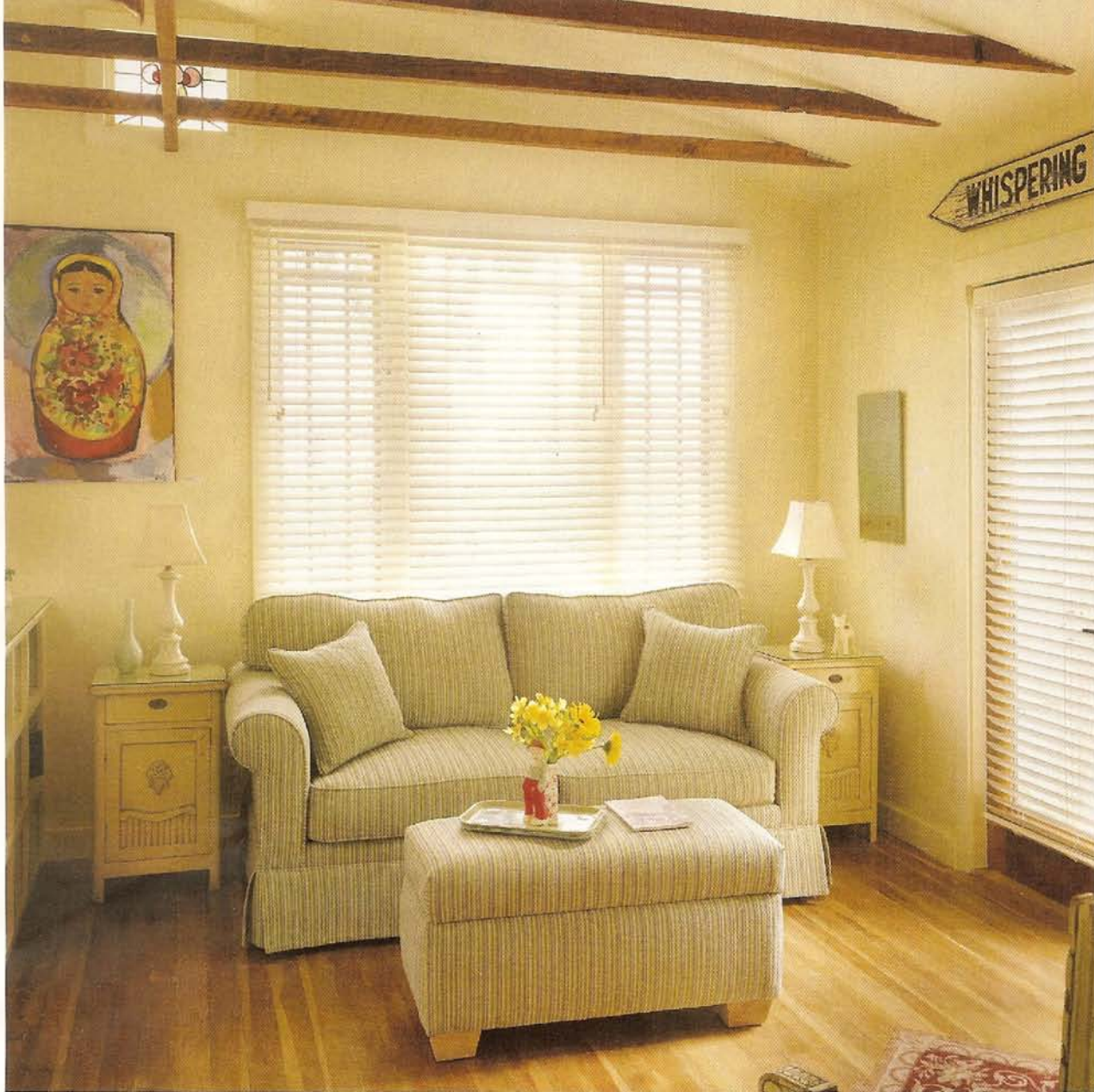
Opposite page: The quaint façades of the three Venice Beach Eco Cottages. Left: The comfortable living room at Aunt Zoe's Place. Below: The mid-century modern living room at Le Bébé Cottage.